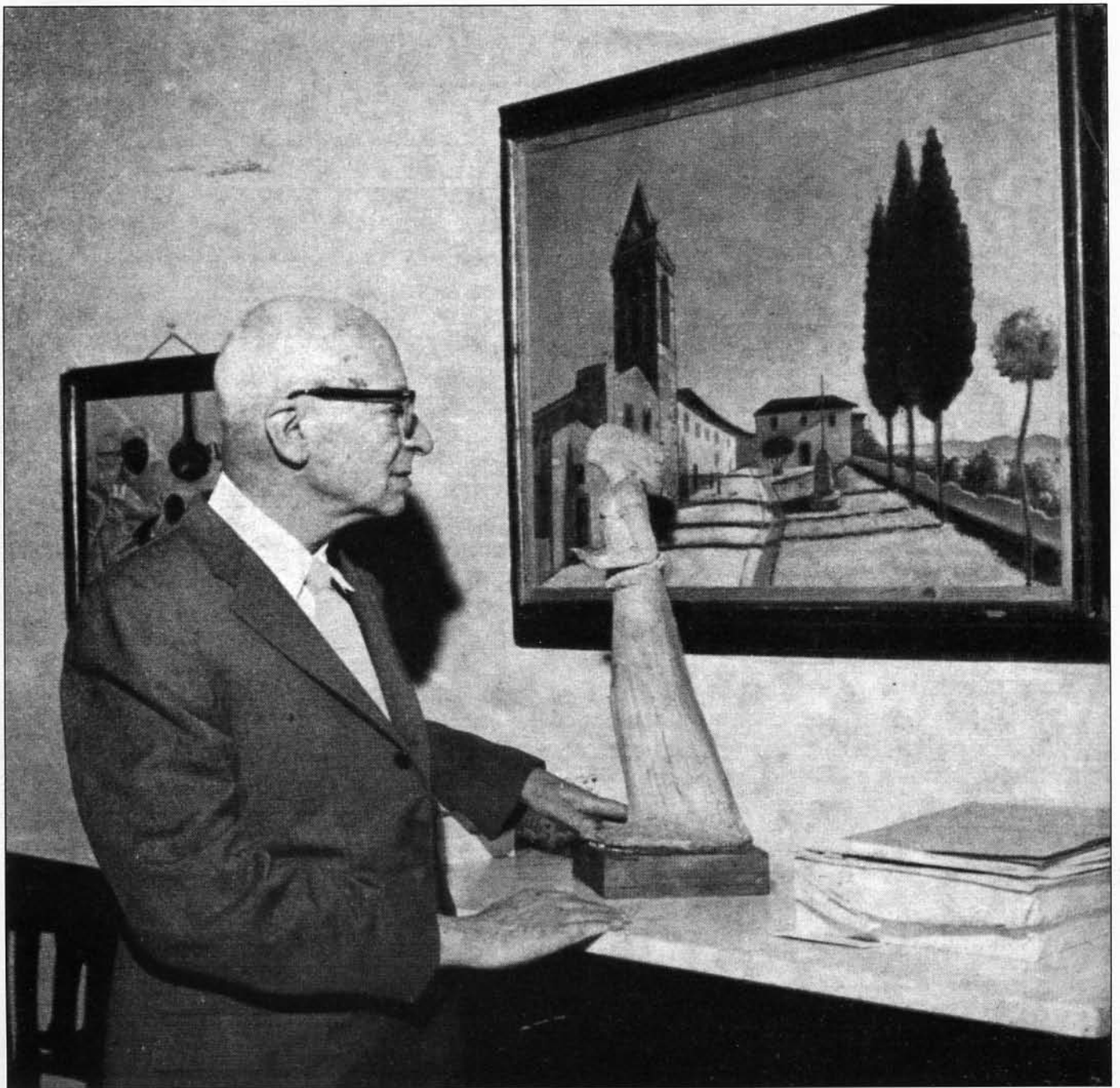
Mario Castelnuovo-Tedesco (1895-1968)